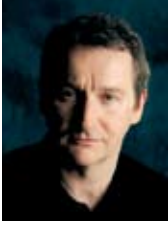
大衛·賓利 David Bintley