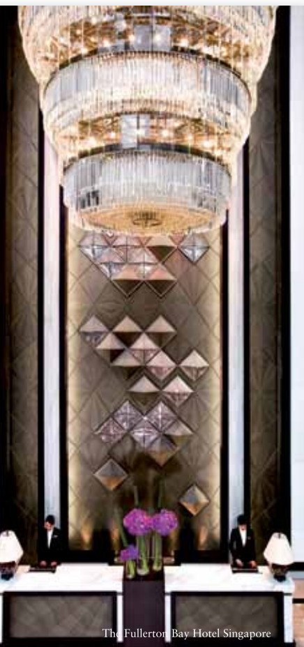
The Fullerton Bay Hotel Singapore