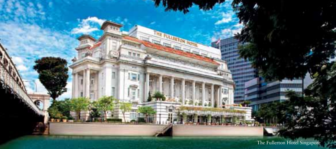
The Fullerton Hotel Singapore